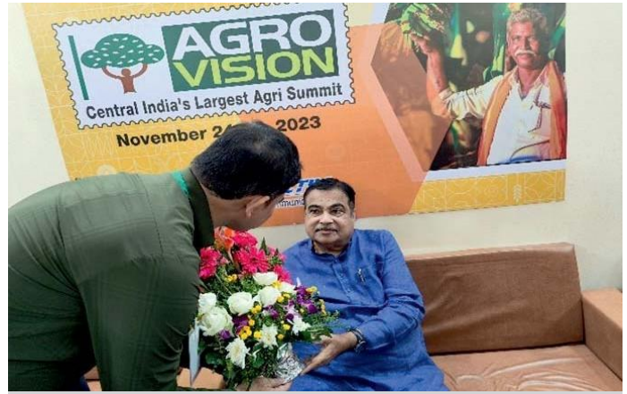
Shri Nitin Gadkari, Honorable Union Minister for Road Transport & Highways, Government of India, Welcomed by COE-Agrotech Team at Agrovision 2023, Nagpur during 24 th to 27 th November 2023