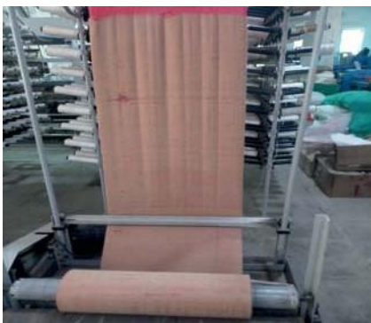
Developed PP/Jute hybrid ground Cover

Despite initial funding delays, the project has been completed, and approved by the PAMC and PAC during its meetings dated 8 th March 2024 and 28 th March 2024 respectively for its completion and release of final Installment. However, the release is pending.