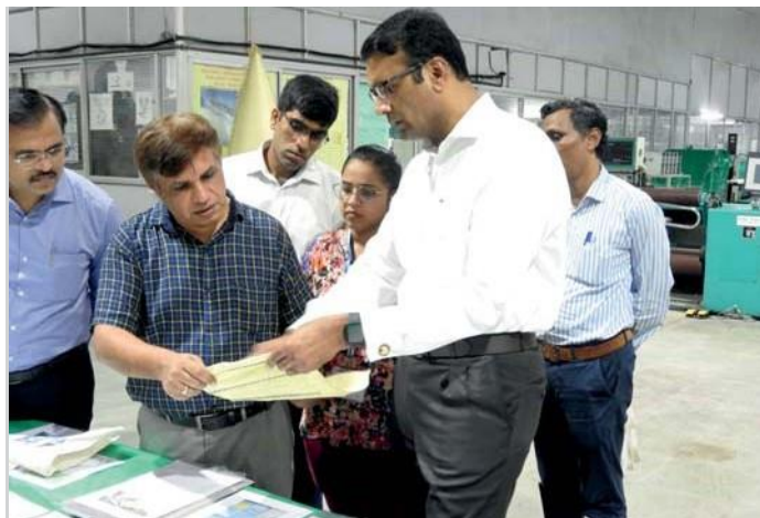
Shri Virendra Singh, IAS, Secretary, Dept. of Textiles, Govt. of Maharashtra visited SASMIRA on 22 nd September 2023

The global increase in the construction of high-rise buildings necessitates the implementation of advanced fire safety measures, particularly efficient and dependable fire escape systems. SASMIRA is conducting in-house research and development for the development of a high-performance fire escape chute system specifically designed for high-rise buildings. The primary objective is to develop an enhance safety standards while ensuring affordability and accessibility through the utilization of local resources and technology. Study of existing fire safety systems in high-rise buildings is being conducted. It has been observed that a seamless fabric would be an ideal solution for the fire escape chute system. A prototype sample has been developed. A detailed project proposal for development of a commercial scale fire escape chute indigenously under National Technical Textiles Mission (NTTM) has been submitted and it is under evaluation.