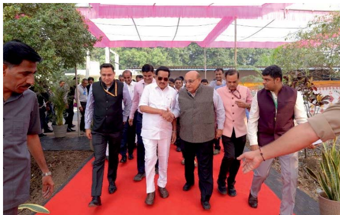
Shri Mihir Mehta, President, SASMIRA welcoming Shri C.R. Paatil, Hon'ble Minister of Jal Shakti, Government of India during Inauguration of the Climate Smart Agrotexile Demonstration Centre, NAU, Navasari

By bridging the gap between research, demonstration, and grassroots adoption, the Centre plays a key role in promoting sustainable agriculture, capacity building, and rural innovation aligned with national goals under the National Technical Textiles Mission (NTTM).