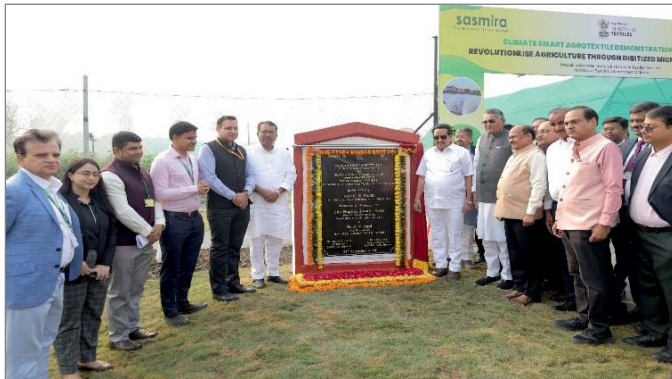
Inauguration of the Climate Smart Agrotextile Demonstration Centre by Shri C.R. Paatil, Hon'ble Minister of Jal Shakti, Government of India, in the esteemed presence of Shri Raghavjibhai Hansrajbhai Patel, Hon'ble Cabinet Minister of Agriculture, Animal Husbandry, Government of Gujarat

Jio Things Limited, having its registered office at Ghansoli is having business of providing various IoT devices, technology services, solutions, platform services and value-added services. The MOU outlines the roles, responsibilities, and contributions of both parties related to Maintenance, of IoT-Devices and/or sensors installed in Climate Smart Agrotextile Demonstration Centre to ensure alignment with the overall strategic goals.