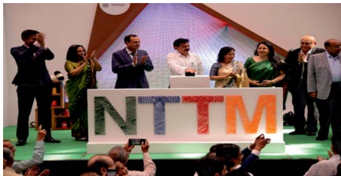
Shri Sanjay Savkare, Hon'ble Cabinet Minister of Textiles, GoM Launching SASMIRA's Next-Generation Circular Weaving Technology for Seamless Geotextiles developed under NTTM, MoT, GoI

The tender document for procurement of Composite 3D printing Machine was advertised and technical bid has been opened. The Financial bid would be opened and the purchase order would be issued to the selected agency upon reassignment of grants.