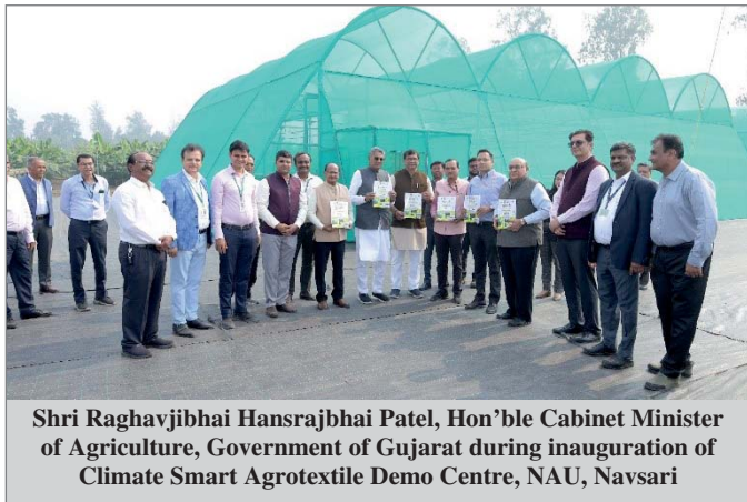
Shri Raghavjibhai Hansrajbhai Patel, Hon'ble Cabinet Minister of Agriculture, Government of Gujarat during inauguration of Climate Smart Agrotextile Demo Centre, NAU, Navsari