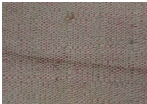
Developed PP/Jute hybrid ground Cover

of project completion report has been submitted. SASMIRA has completed the Project and Completion report has been submitted to O/o JTXC. Final instalment under the project has been received from Ministry of Textiles, Gol.